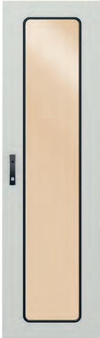
Single-leaf door with glass