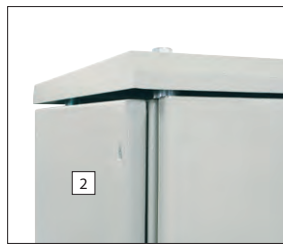
2 - external side panel