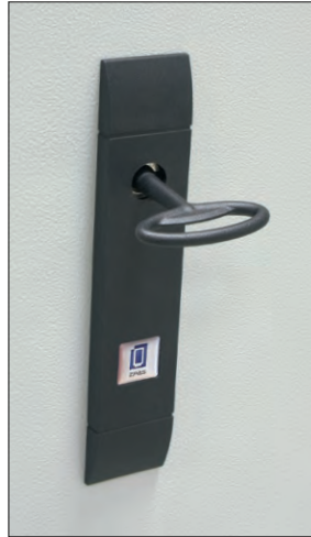
Lock with double-bit insert (factory installed)