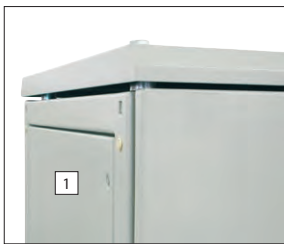
1 - flushed side panel